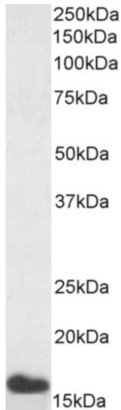
EB09119 (0.3 \mu g/ml) staining of Human Bone Marrow lysate (35 \mu g protein in RIPA buffer). Detected by chemiluminescence.