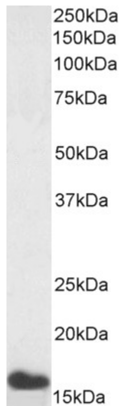
EB09119 (0.3 \mu g/ml) staining of Human Bone Marrow lysate (35 \mu g protein in RIPA buffer). Detected by chemiluminescence.