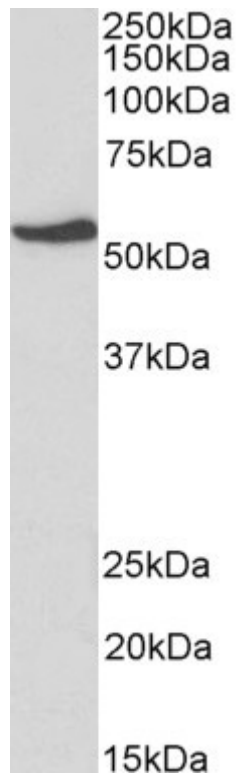
EB12284 (1µg/ml) staining of HepG2 lysate (35µg protein in RIPA buffer). Detected by chemiluminescence.