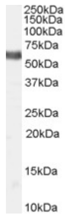
EB07404 (2µg/ml) staining of Human Thyroid lysate (35µg protein in RIPA buffer). Detected by chemiluminescence.