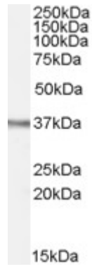
EB07884 (0.1µg/ml) staining of Rat Spleen lysate (35µg protein in RIPA buffer). Primary incubation was 1 hour. Detected by chemiluminescence.