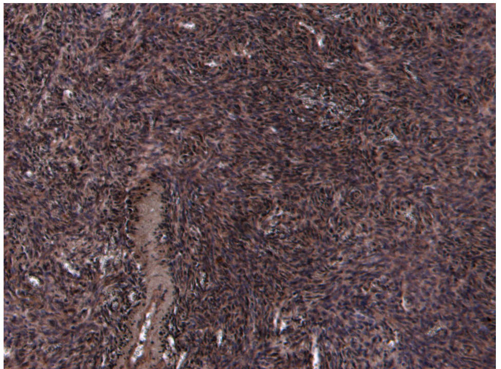
EB07183 (8µg/ml) staining of paraffin embedded Human Ovary. Heat induced antigen retrieval with citrate buffer pH 6, HRP-staining.