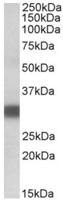
EB10505 (0.1µg/ml) staining of Human Heart lysate (35µg protein in RIPA buffer). Detected by chemiluminescence.