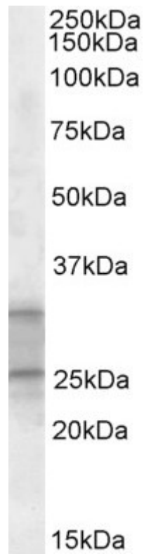
EB09427 (1 \mu g/ml) staining of Human Heart lysate (35 \mu g protein in RIPA buffer). Primary incubation was 1 hour. Detected by chemiluminescence.