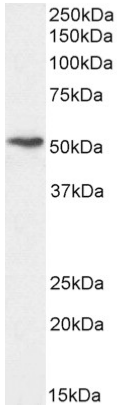
EB07728 (1 \mu g/ml) staining of Jurkat cell lysate (35 \mu g protein in RIPA buffer). Detected by chemiluminescence.