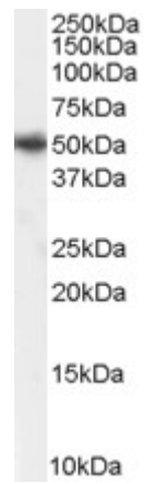
EB07467 (1 \mu g/ml) staining of Mouse Brain lysate (35 \mu g protein in RIPA buffer). Detected by chemiluminescence.