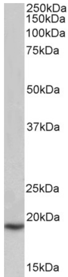
EB12467 (0.1µg/ml) staining of Placenta lysate (35µg protein in RIPA buffer). Detected by chemiluminescence.