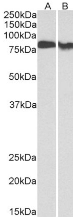
EB11585 (0.3 \mu g/ml) staining of Human Placenta (A) and Rat Brain (B) lysates (35 \mu g protein in RIPA buffer). Primary incubation was 1 hour. Detected by chemiluminescence.