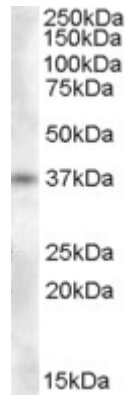
EB08195 (0.3 \mu g/ml) staining of Human Adrenal Gland lysate (35 \mu g protein in RIPA buffer). Primary incubation was 1 hour. Detected by chemiluminescence.