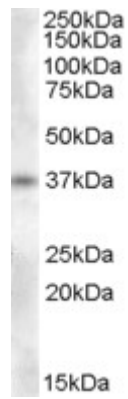
EB08195 (0.3 \mu g/ml) staining of Human Adrenal Gland lysate (35 \mu g protein in RIPA buffer). Primary incubation was 1 hour. Detected by chemiluminescence.