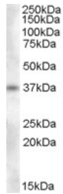
EB08195 (0.3µg/ml) staining of Human Adrenal Gland lysate (35µg protein in RIPA buffer). Primary incubation was 1 hour. Detected by chemiluminescence.