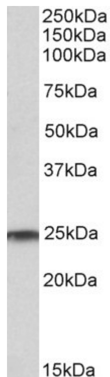
EB10644 (1µg/ml) staining of Human Testis lysate (35µg protein in RIPA buffer). Detected by chemiluminescence.