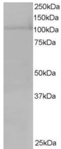
EB06243 staining (0.5µg/ml) of Hela lysate (RIPA buffer, 35µg total protein per lane). Primary incubated for 1 hour. Detected by chemiluminescence.