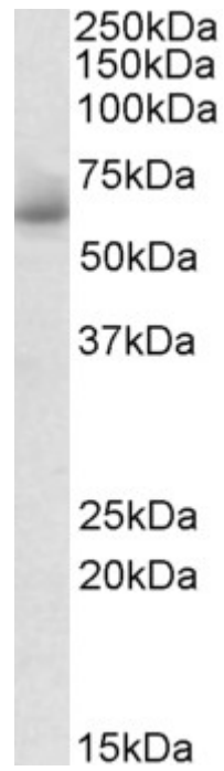
EB10365 (1 \mu g/ml) staining of Human Testis lysate (35 \mu g protein in RIPA buffer). Detected by chemiluminescence.