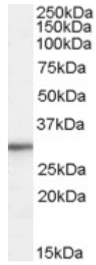
EB07869 (0.01 \mu\text{g/ml} ) staining of HepG2 cell lysate (35 \mu\text{g} protein in RIPA buffer). Detected by chemiluminescence.