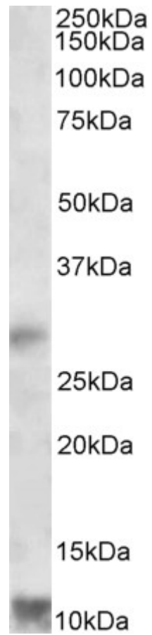
EB09769 (1 \mu g/ml) staining of Human Heart lysate (35 \mu g protein in RIPA buffer). Primary incubation was 1 hour. Detected by chemiluminescence.