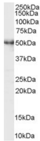
EB05368 staining (0.5µg/ml) of Jurkat lysate (RIPA buffer, 35µg total protein per lane). Primary incubated for 1 hour. Detected by chemiluminescence.