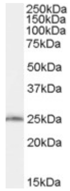
EB07902 (0.03µg/ml) staining of Mouse Liver lysate (35µg protein in RIPA buffer). Primary incubation was 1 hour. Detected by chemiluminescence.