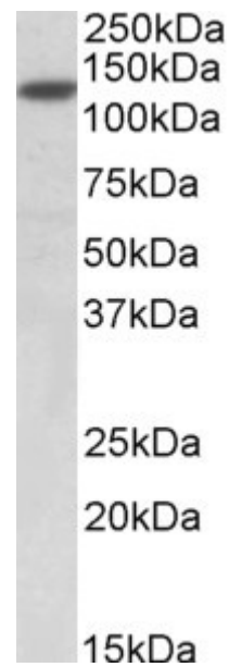
EB10826 (0.05µg/ml) staining of Jurkat lysate (35µg protein in RIPA buffer). Primary incubation was 1 hour. Detected by chemiluminescence.