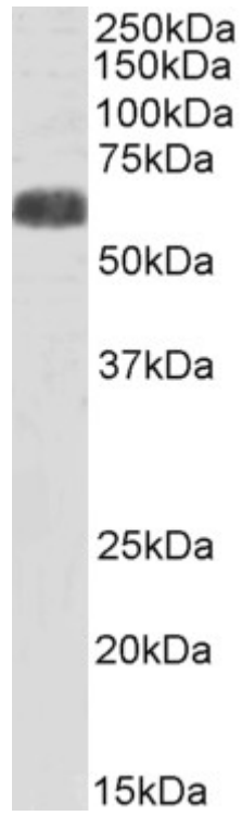
EB12064 (0.3 \mu g/ml) staining of Human Heart lysate (35 \mu g protein in RIPA buffer). Detected by chemiluminescence