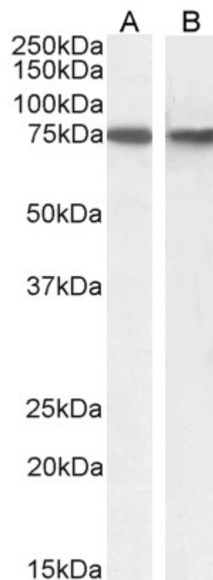
EB09792 (1 \mu g/ml) staining of HeLa (A) and (0.1 \mu g/ml) U2OS (B) cell lysate (35 \mu g protein in RIPA buffer).. Detected by chemiluminescence.