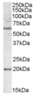
EB09032 (1µg/ml) staining of HEK293 lysate (35µg protein in RIPA buffer). Detected by chemiluminescence.