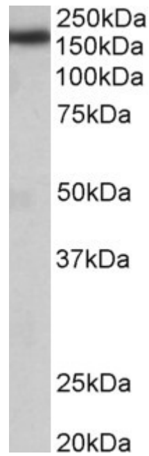
EB11087 (0.05µg/ml) staining of Rat Brain lysate (35µg protein in RIPA buffer). Primary incubation was 1 hour. Detected by chemiluminescence.