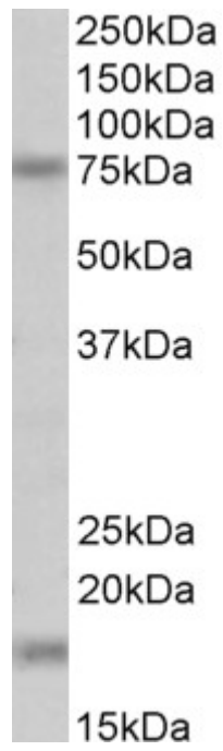
EB10507 (0.1 \mu g/ml) staining of Mouse Kidney lysate (35 \mu g protein in RIPA buffer). Primary incubation was 1 hour. Detected by chemiluminescence.