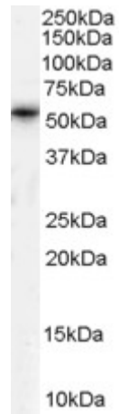
EB07380 (1 \mu g/ml) staining of Human Testis lysate (35 \mu g protein in RIPA buffer). Primary incubation was 1 hour. Detected by chemiluminescence.