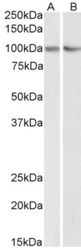
EB09901 (0.3 \mu g/ml) staining of HEK293 (A) and NIH3T3 (B) lysate (35 \mu g protein in RIPA buffer). Primary incubation was 1 hour. Detected by chemiluminescence.