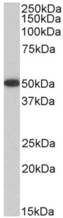
EB12619 (0.01 \mu g/ml) staining of Human Platelets lysate (35 \mu g protein in RIPA buffer). Primary incubation was 1 hour. Detected by chemiluminescence.