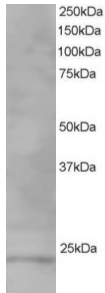
EB06276 staining (1 \mu g/ml) of Human Testis lysate (RIPA buffer, 35 \mu g total protein per lane). Primary incubated for 1 hour. Detected by chemiluminescence.