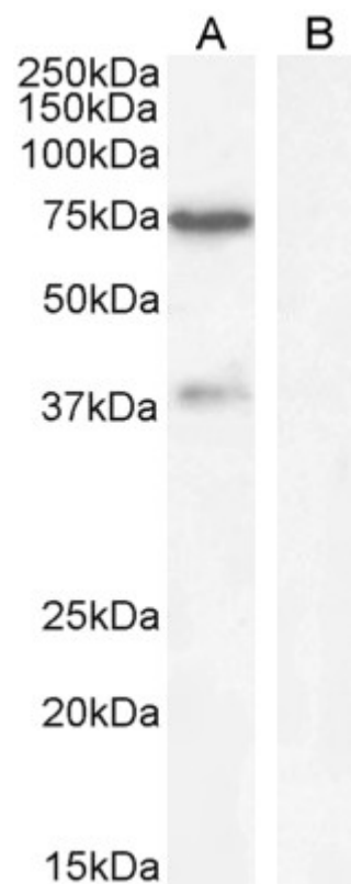
EB09114 (1 \mu g/ml) staining of Human Cerebellum lysate (A) + Blocking peptide (B) (35 \mu g protein in RIPA buffer). Detected by chemiluminescence.