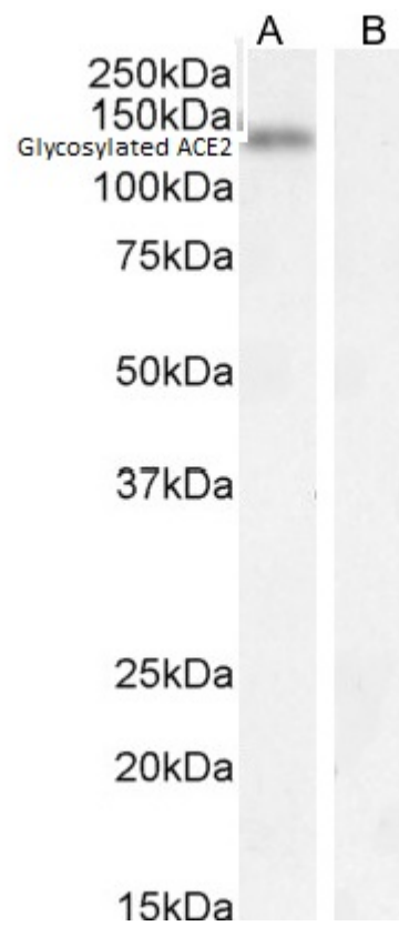
EB13085 (0.5µg/ml) staining of Human Kidney lysate (A) + Peptide (B) (35µg protein in RIPA buffer). Detected by chemiluminescence.