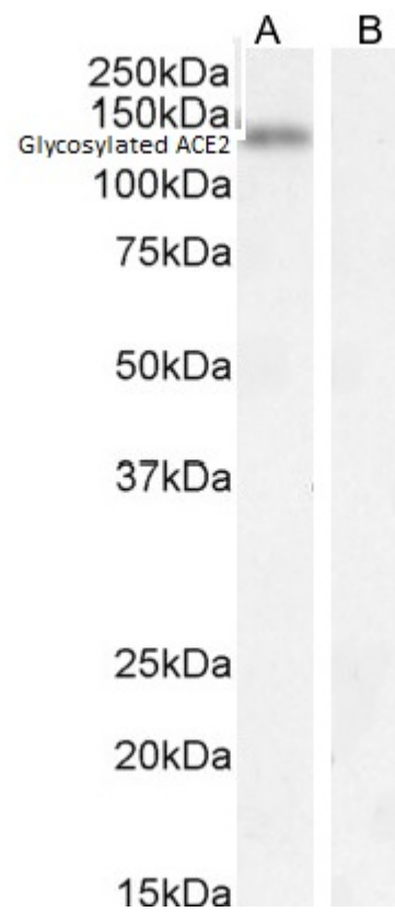
EB13085 (0.5µg/ml) staining of Human Kidney lysate (A) + Peptide (B) (35µg protein in RIPA buffer). Detected by chemiluminescence.