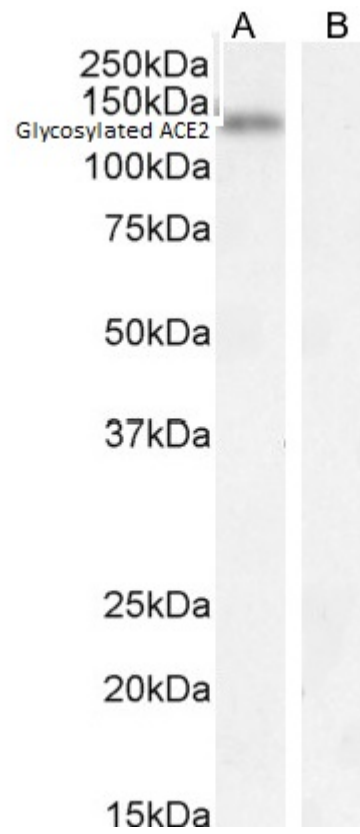
EB13085 (0.5 \mu g/ml) staining of Human Kidney lysate (A) + Peptide (B) (35 \mu g protein in RIPA buffer). Detected by chemiluminescence.