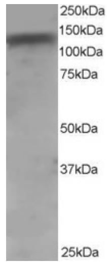
EB05382 staining (0.2 \mu g/ml) of Human HeLa lysate (RIPA buffer, 35 \mu g total protein per lane). Detected by chemiluminescence.