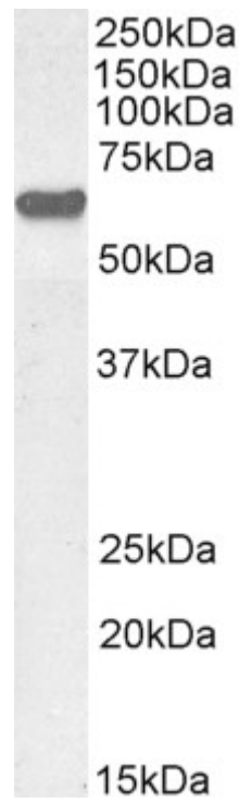
EB07691 (0.3 \mu g/ml) staining of MCF7 cell lysate (35 \mu g protein in RIPA buffer). Detected by chemiluminescence.