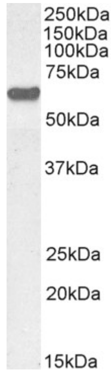
EB07691 (0.3 \mu g/ml) staining of MCF7 cell lysate (35 \mu g protein in RIPA buffer). Detected by chemiluminescence.