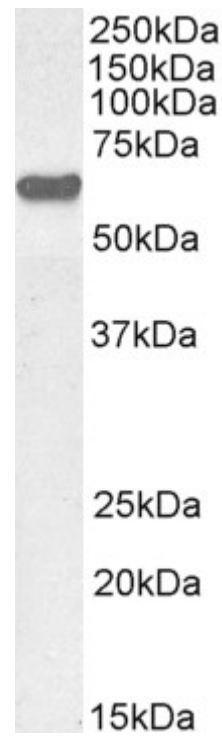
EB07691 (0.3 \mu g/ml) staining of MCF7 cell lysate (35 \mu g protein in RIPA buffer). Detected by chemiluminescence.