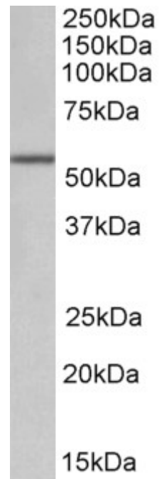
EB10437 (0.1 \mu g/ml) staining of Mouse Kidney lysate (35 \mu g protein in RIPA buffer). Primary incubation was 1 hour. Detected by chemiluminescence.