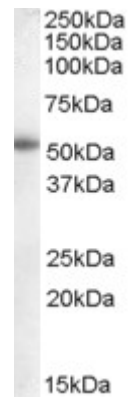
EB08329 (0.1 \mu g/ml) staining of Human Placenta lysate (35 \mu g protein in RIPA buffer). Detected by chemiluminescence.