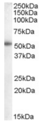
EB08329 (0.1µg/ml) staining of Human Placenta lysate (35µg protein in RIPA buffer). Detected by chemiluminescence.