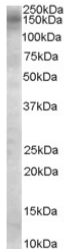
EB07591 (0.1µg/ml) staining of Daudi cell lysate (35µg protein in RIPA buffer). Primary incubation was 1 hour. Detected by chemiluminescence.