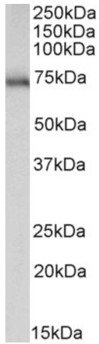
EB12627 (0.3 \mu g/ml) staining of Mouse fetal Brain lysate (35 \mu g protein in RIPA buffer). Detected by chemiluminescence.