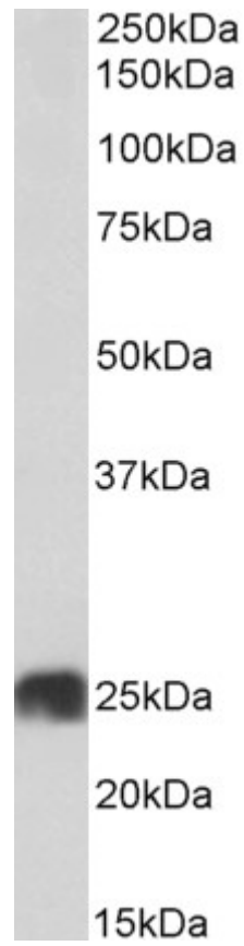
EB12464 (0.03 \mu g/ml) staining of Human Heart lysate (35 \mu g protein in RIPA buffer). Detected by chemiluminescence.