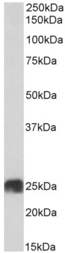
EB12464 (0.03 \mu g/ml) staining of Human Heart lysate (35 \mu g protein in RIPA buffer). Detected by chemiluminescence.