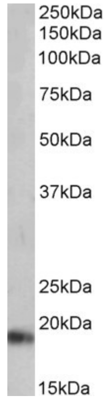
EB11166 (0.01µg/ml) staining of Mouse Heart lysate (35µg protein in RIPA buffer). Primary incubation was 1 hour. Detected by chemiluminescence.