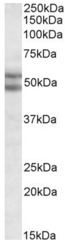
EB05487 (2 \mu g/ml) staining of nuclear HeLa lysate (35 \mu g protein in RIPA buffer). Primary incubation was 1 hour. Detected by chemiluminescence.