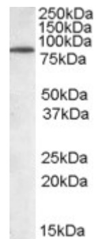
EB05868 staining (0.05 \mu g/ml) of Mouse Brain lysate (RIPA buffer, 30 \mu g total protein per lane). Primary incubated for 1 hour. Detected by chemiluminescence.