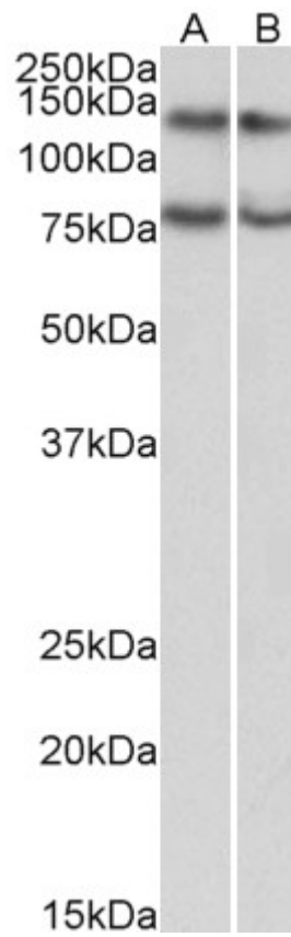
EB12638 (0.3µg/ml) staining of Jurkat (A) and HeLa (B) lysates (35µg protein in RIPA buffer). Detected by chemiluminescence.