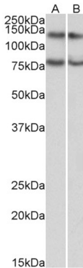
EB12638 (0.3µg/ml) staining of Jurkat (A) and HeLa (B) lysates (35µg protein in RIPA buffer). Detected by chemiluminescence.