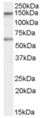
EB05886 staining (1 \mu g/ml) of Human Jurkat cells (RIPA buffer, 35 \mu g total protein per lane). Primary incubated for 1 hour. Detected by chemiluminescence.