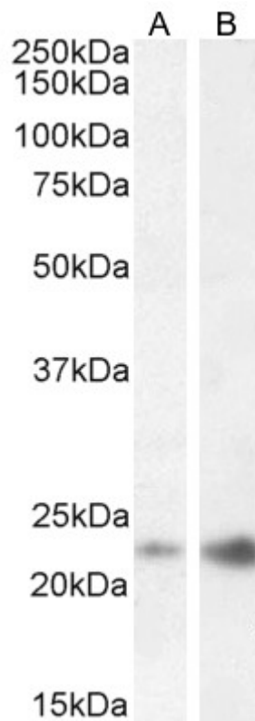
B09304 (0.1µg/ml) staining of Human Skeletal Muscle (A) and Rat Heart (B) lysate (35µg protein in RIPA buffer). Detected by chemiluminescence.