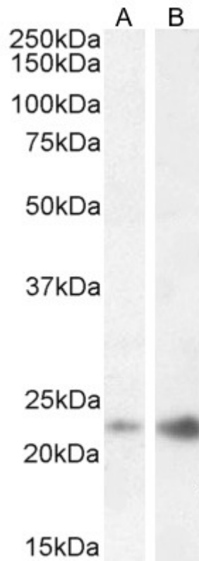
B09304 (0.1 \mu g/ml) staining of Human Skeletal Muscle (A) and Rat Heart (B) lysate (35 \mu g protein in RIPA buffer). Detected by chemiluminescence.