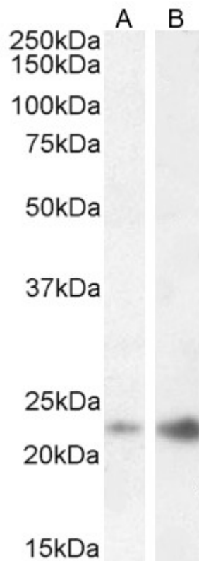
B09304 (0.1µg/ml) staining of Human Skeletal Muscle (A) and Rat Heart (B) lysate (35µg protein in RIPA buffer). Detected by chemiluminescence.