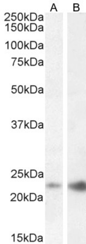
B09304 (0.1µg/ml) staining of Human Skeletal Muscle (A) and Rat Heart (B) lysate (35µg protein in RIPA buffer). Detected by chemiluminescence.