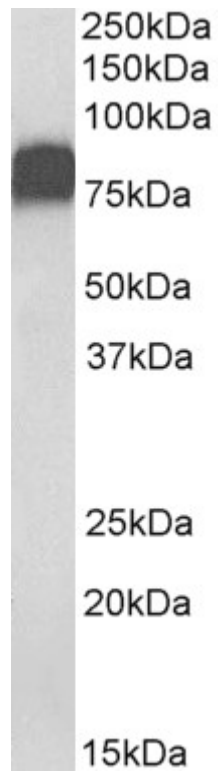
EB12255 (0.03 \mu g/ml) staining of U-2 OS lysate (35 \mu g protein in RIPA buffer). Primary incubation was 1 hour. Detected by chemiluminescence.