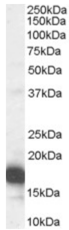
EB07094 (1µg/ml) staining of HeLa Lysate (35µg protein in RIPA buffer). Primary incubation was 1 hour. Detected by chemiluminescence.