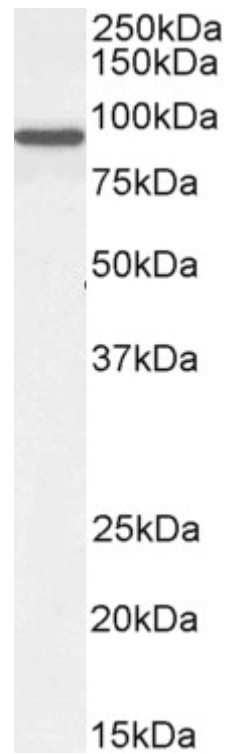
EB06123 (0.3 \mu g/ml) staining of NIH3T3 cell lysate (35 \mu g protein in RIPA buffer). Primary incubation was 1 hour. Detected by chemiluminescence.