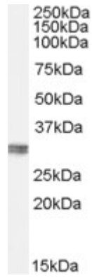
EB07738 (0.1 \mu g/ml) staining of Human Kidney lysate (35 \mu g protein in RIPA buffer). Primary incubation was 1 hour. Detected by chemiluminescence.